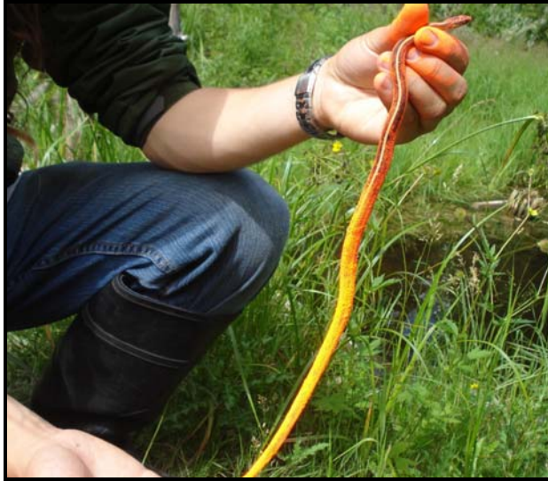
FIGURE 1. Common Garter Snake ( Thamnophis sirtalis ) immediately following application of orange fluorescent powder.

gently tipping the bag in various directions to coat all sides of the snake (Fig. 1). Powdering was carried out away from the capture/release area. During powdering, the snake's head was kept out of the bag to ensure that no powder got into the eyes or mouth. The powder we used (approx. $10 US/lb, Radiant Color Series T1, DayGlo Color Corporation, Cleveland, Ohio) was either orange or green. Graeter and Rothermel (2007) suggested that green was among the best performing color (the other being chartreuse) followed by orange and pink. Our selection of color was based upon proximity to other snakes released the same day and to previous tracks that persisted in the environment. Thus we avoided confusion of individual paths, as suggested by Stark and Fox (2000). Once the powder was applied, we carried snakes to the site of release, still within the bag, and then removed and placed them on the ground. We released all snakes within 5 m of their original capture sites when the temperature was > 15^{\circ}\text{C} ; time of release varied from late morning to early afternoon.