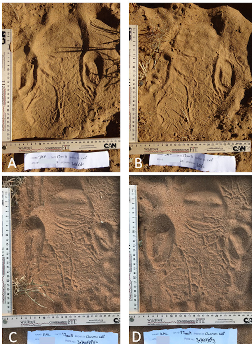
Figure 1 A left hind rhino footprint showing distinctive heel lines. A and B are two different footprints from the same trail made by one rhino and C and D two footprints from the same trail of a different rhino. The heel patterns can be visually matched in each pair.