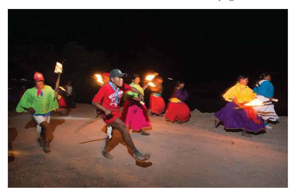
Figure 2. Nighttime scene during a rarajípare race in Huisuchi. Note the runner kicking the ball with a flicking motion as others accompany him with torches to illuminate the way.

terrain is open and relatively free of rocks and bushes, they will kick the ball distances of 50 meters or more; if the terrain is rough or the trail very narrow, they kick it shorter distances to maintain control. If the ball breaks, the team is allowed to wait while one member of the team runs to grab another ball at the starting line and then begin again from where they stopped. In all pueblos, to lose the ball or touch it with one's hands is to lose the race, a very real possibility when referees (jueces) are stationed along the course, as is sometimes the case in major races. However, runners in some communities are allowed to use wooden sticks, palos, to help place the ball on the top of the foot. In the ariwete, women use hooked sticks to flick a hoop made from strands of the stiff, fibrous yucca plant or sprigs from the guásima tree (Guazumaulmifolia) that are wrapped tightly with colorful cloth (fig. 3). The first team to run a predetermined number of laps wins, but in some races, victory can also come when an opposing team forfeits the race by losing the ball or the hoop, being lapped, or getting caught using their hands or engaging in some other form of cheating.