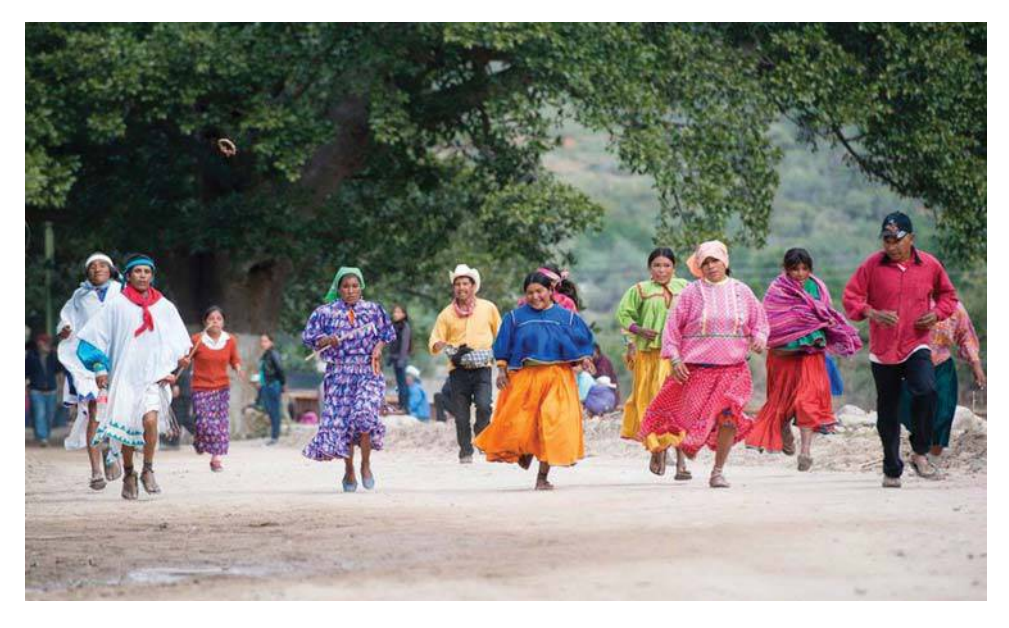
Figure 3. Ariwete race in Urique. As with rarajípare, some of these runners have joined in the race temporarily to accompany the core team of runners (those carrying sticks). The hoop is visible above and slightly to the right of the man in a white tunic.

a special kind of support termed poder de mujer (woman power) in which a dozen or more women will surround an exhausted male runner for several kilometers during a race, matching him stride for stride, chanting in cadence. In ariwete, the core runners are mostly young women aged 10 to 20 years who do not yet have children. As with rarajípare, members of the community often join in ariwete for a lap or two to encourage the runners.