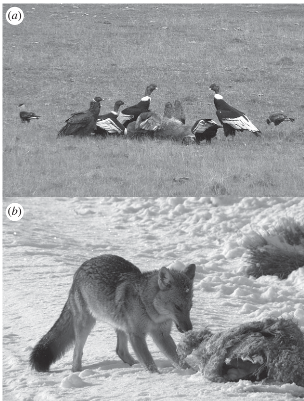
Figure 2. (a) Large Andean condors and a pair of smaller southern caracaras surround a guanaco ( Lama guanicoe ) killed by a female puma in Patagonia. (b) A culpeo fox scavenging from a guanaco carcass abandoned by a female puma.

wolves also defend their kills from competitors [21]. Solitary felids, by contrast, often retreat to cover to remain unobtrusive and minimize conflicts with other competitors [23], and thus are more susceptible to kleptoparasitism.