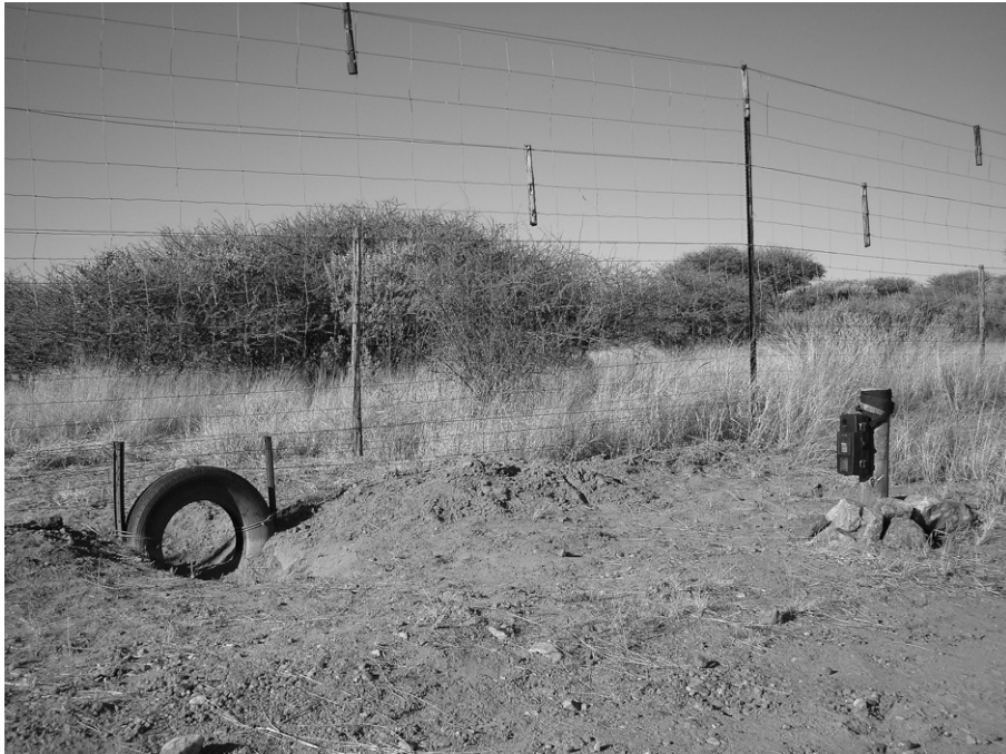
Fig. 1. Car tyre passageway with trail camera monitoring setup.

Gibson 2010; Williamson & Williamson 1984). Moreover, the negative impacts of wildlife-proof fences can manifest at the individual, population, species, community and ecosystem level (Gadd 2012).