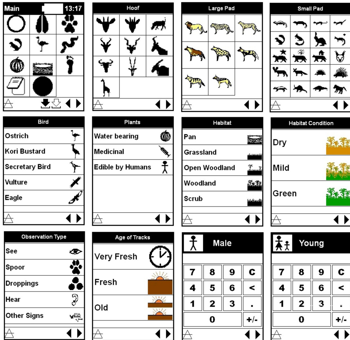
Fig. 2. Examples of Icon User Interface designs.