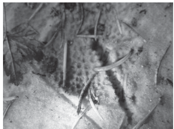
Figure 2. An impression of metacarpal dimpling from a porcupine captured by the foam track plate during field trials.

In a separate test, running water from a tap on the foam plate for 10 minutes had no obvious affect on the plate or dog tracks imprinted in the plate. Furthermore, the wetted foam plate maintained its ability to register further impressions. Freezing the